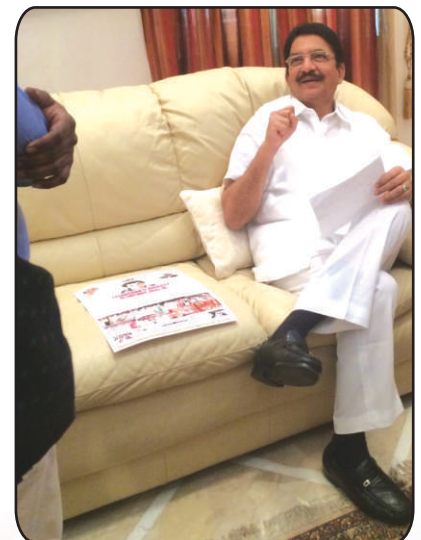
SRF Chairman met the Governor of Maharashtra to Invited him as a Chief Guest of our Awards Function